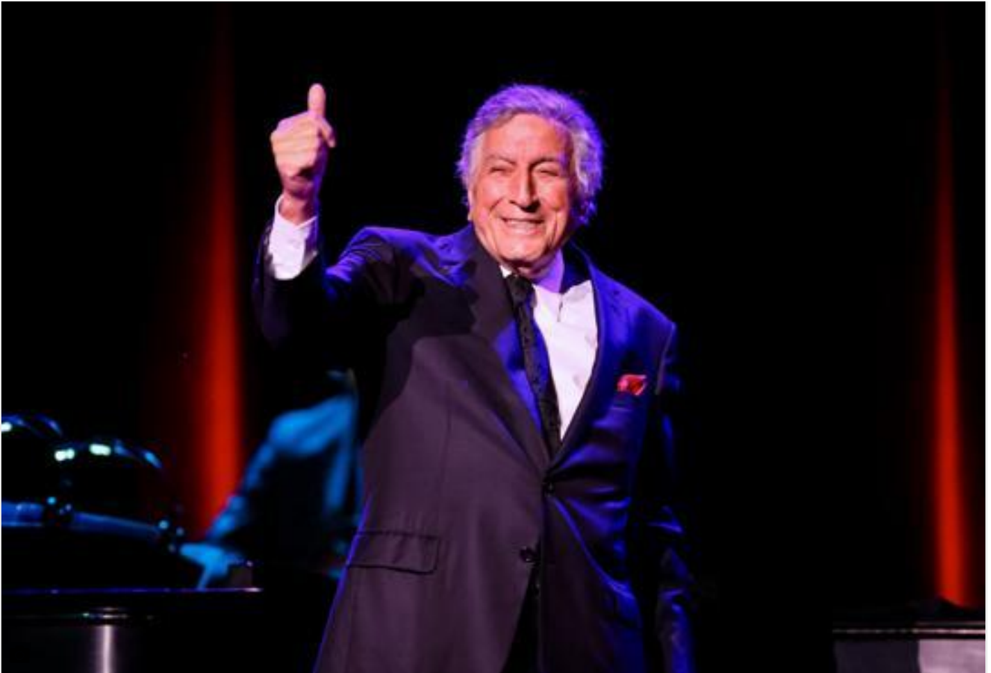
Photos: Tony Bennett at the Keith-Albee Updated Sep 30, 2016