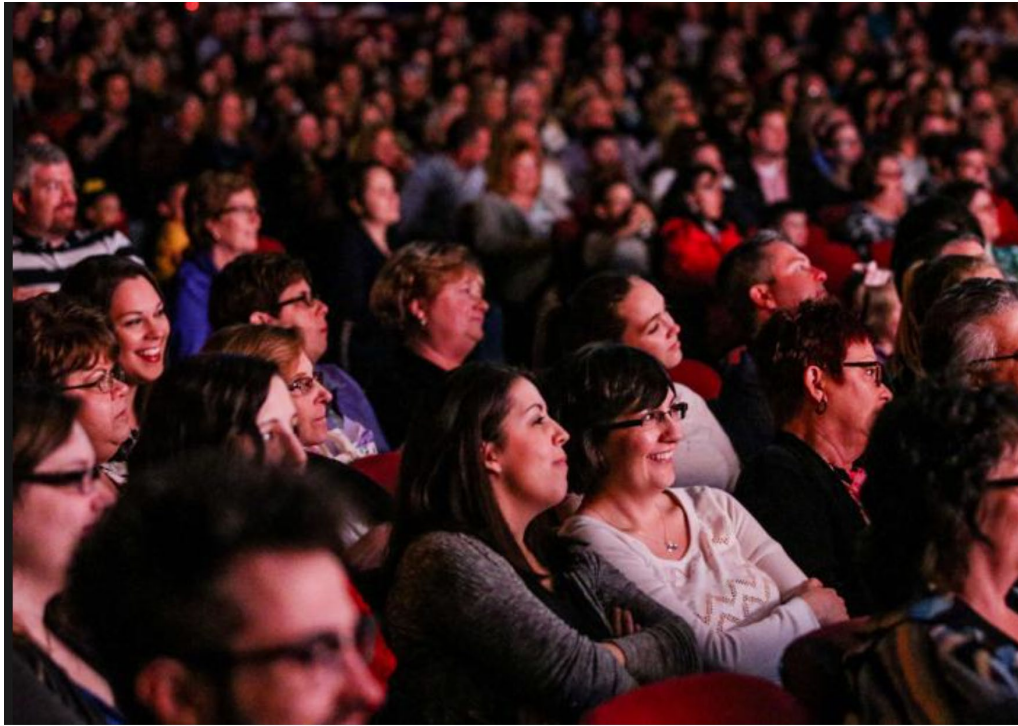
A packed house watches on as the Marshall Artist Series presents Disney's "Beauty & The Beast" on Tuesday, April 14, 2015, at the the Keith Albee Performing Arts Center in downtown Huntington.